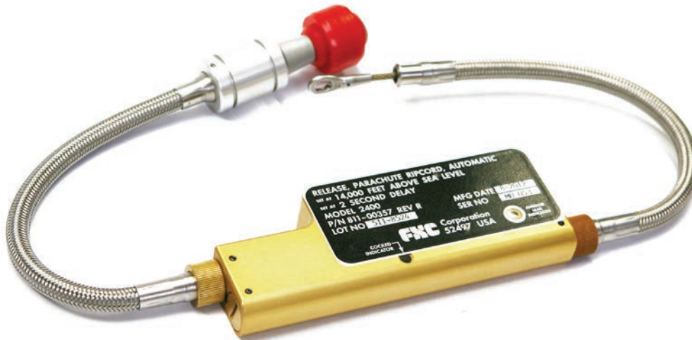
Release, Parachute Ripcord, Automatic Model 2400, P/N 811-00357(-11), NSN 1670-01-502-3319